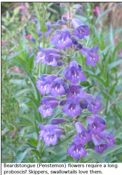
Beardstongue ( Penstemon ) flowers require a long proboscis! Skippers, swallowtails love them.

Spring blooming, shade preferring. A favorite of hummingbirds as well.