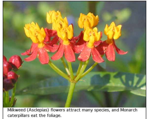
Milkweed ( Asclepias ) flowers attract many species, and Monarch caterpillars eat the foliage.

White-flowered varieties bloom late spring. Pink forms bloom in summer.